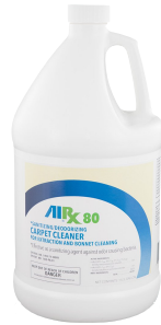
Airx 80 Sanitizing/ Deodorizing Carpet Cleaner