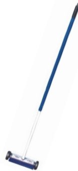
Jet Clean Brush