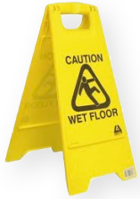
Wet Floor Signs