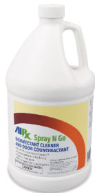
AirX Spray N Go Disinfectant Cleaner & Odor Counteractant