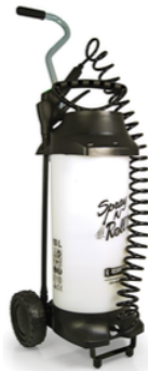
Sprayer on Wheels