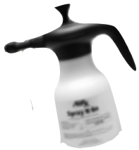
Hand Pump-up Sprayer Spray-N-Go