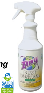
Zing Dust Control

Apply Zing Dust Control to dust mops and entrance mats daily. Dust Control flocculates loose dust and dirt so you spend less time cleaning your floor.