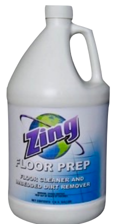
Zing Floor Prep

You can remove most “Ground-In Dirt” by using ZING FLOOR PREP . FLOOR PREP removes dirt that has penetrated into the floor or floor finish eliminating the need for stripping.