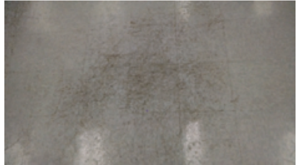
This is area where chairs, tables and children's feet were present.