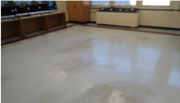
This is classroom with chairs & tables removed.