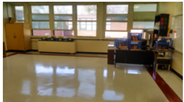
This is same floor after being scrubbed, burnished and 2 coats of Floor finish applied.

Scrubbing this floor restored the damaged areas without removing the base coats of finish. If the floor were completely stripped there would be no shine present. The shine shows that floor finish is still there after being scrubbed and burnished.