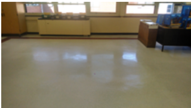
This is the floor after being scrubbed with Zing Floor Prep .