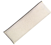
Microfiber Flat Mop Finish Applicator