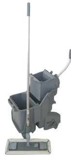
Mop & Bucket