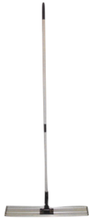
Microfiber Flat Mop Holder w/adjustable handle