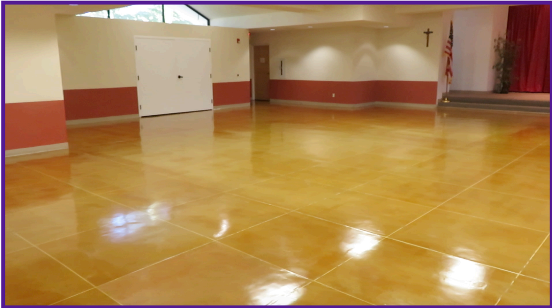
Third Coat Zing First Impression Coating