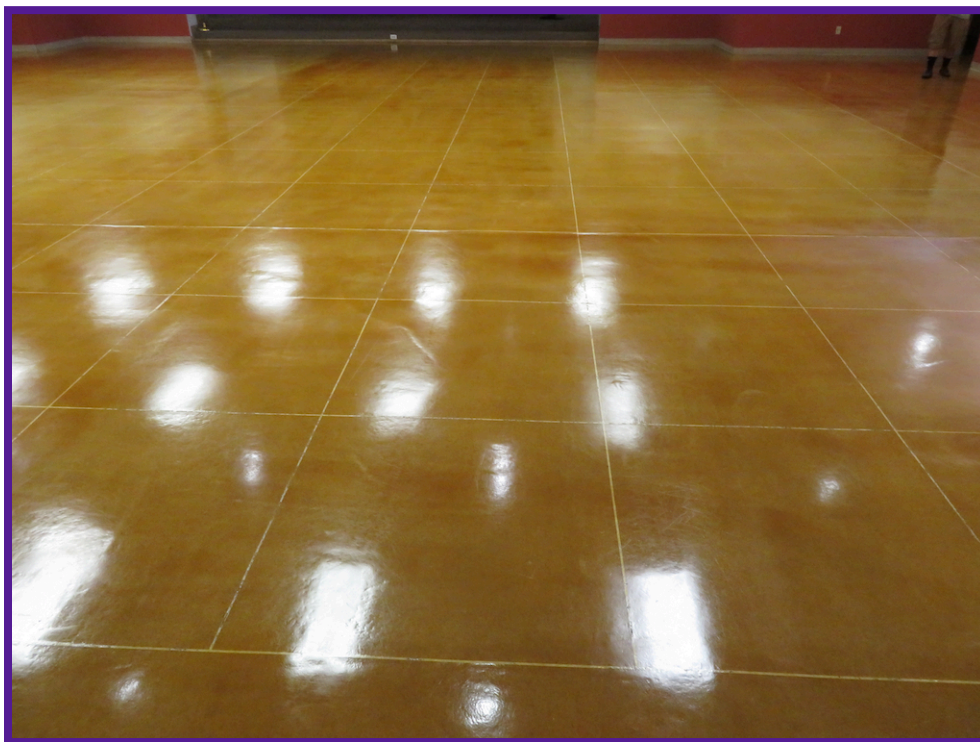
Second Coat Zing First Impression Coating

First Coat - This photo shows the first coat of Zing First Impression Floor Coating . Be sure each coat is dry before adding another coat. To be sure finish is dry follow Zing Floor Care Technique #1- “When is newly applied floor finish dry and ready for traffic or re-coating?” You can see this technique and many others @ zingfloorcare.com