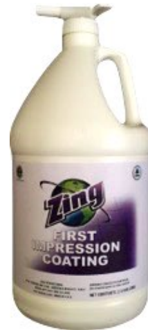
Zing First Impression Coating with Dispensing Valve.