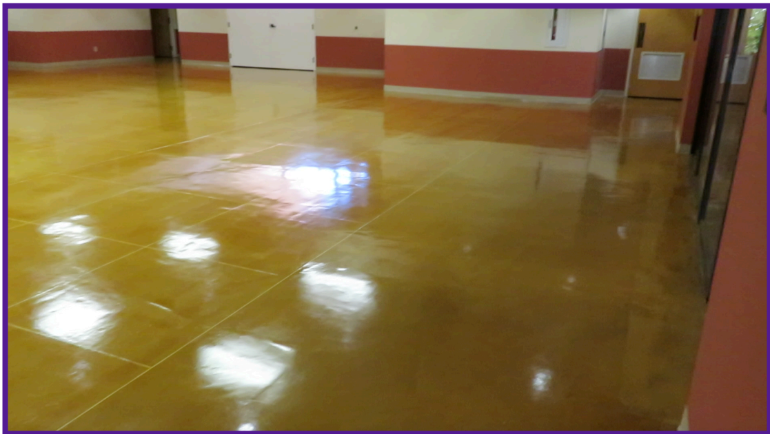
Fourth Coat Zing First Impression Coating